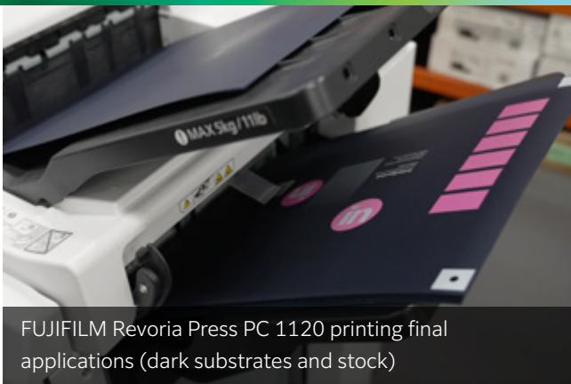
FUJIFILM Revoria Press PC 1120 printing final applications (dark substrates and stock)

And the numbers, just since commissioning in late 2023, tell a compelling story of growth and efficiency: a 35-40% increase in productivity (time saving as well as increased volume), coupled with an emerging understanding of the possibility of a 30-40% increase in throughput even with the small existing team. These figures represent not just improved performance, but a fundamental shift in what’s possible for a small, regional print shop.