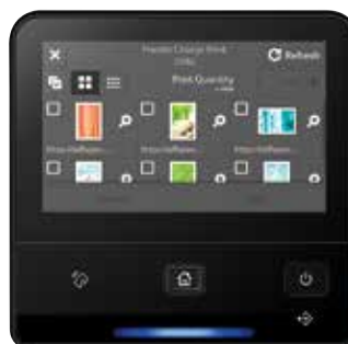
5-inch colour touch panel